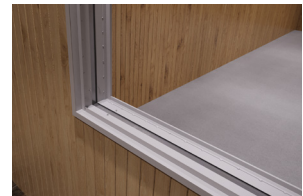
12 Gauge Steel Frame